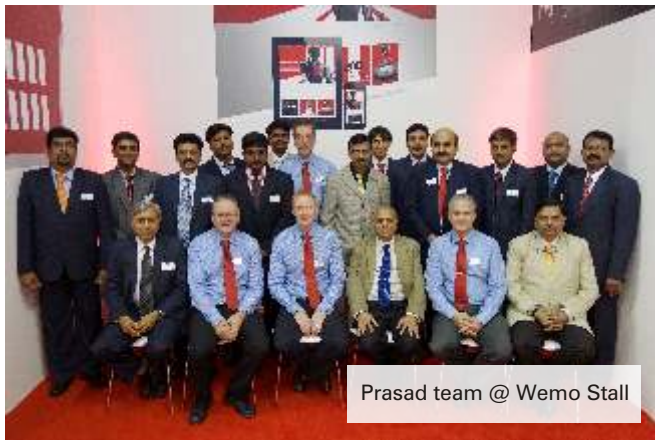
Prasad team @ Wemo Stall