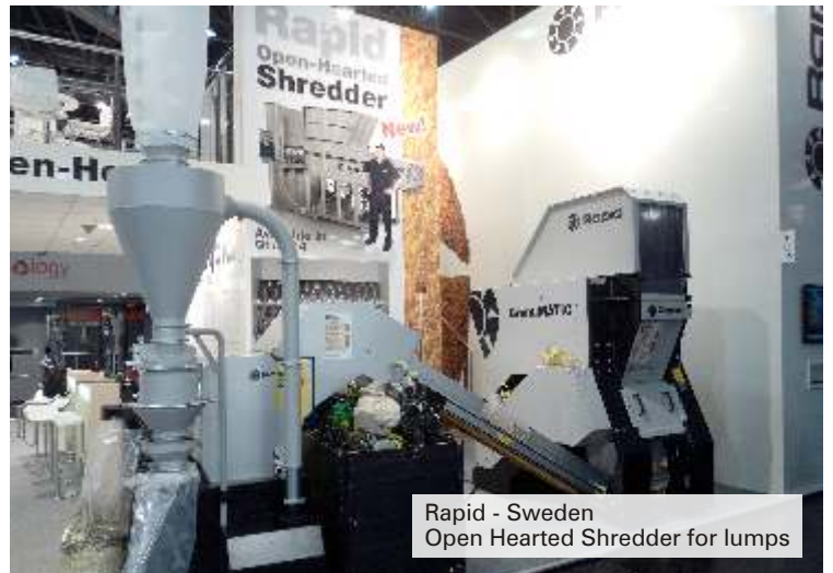
Rapid - Sweden Open Hearted Shredder for lumps