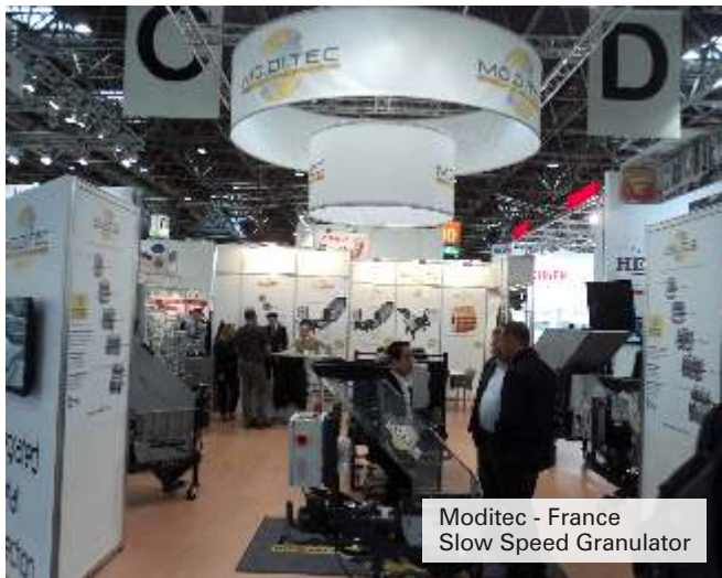
Moditec - France Slow Speed Granulator