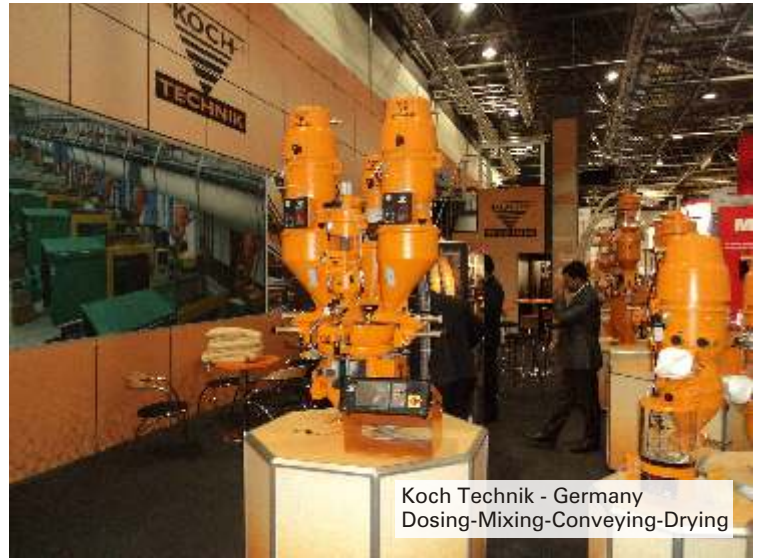
Koch Technik - Germany Dosing-Mixing-Conveying-Drying