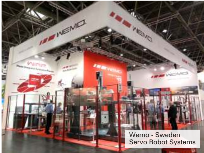
Wemo - Sweden Servo Robot Systems