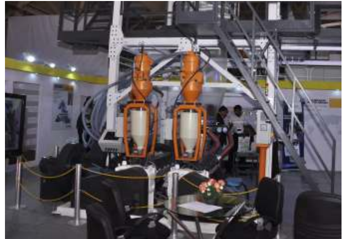
Extrusion Process Monitoring System on Three Layer Blown Film Plant for continuous display of output in each layer.