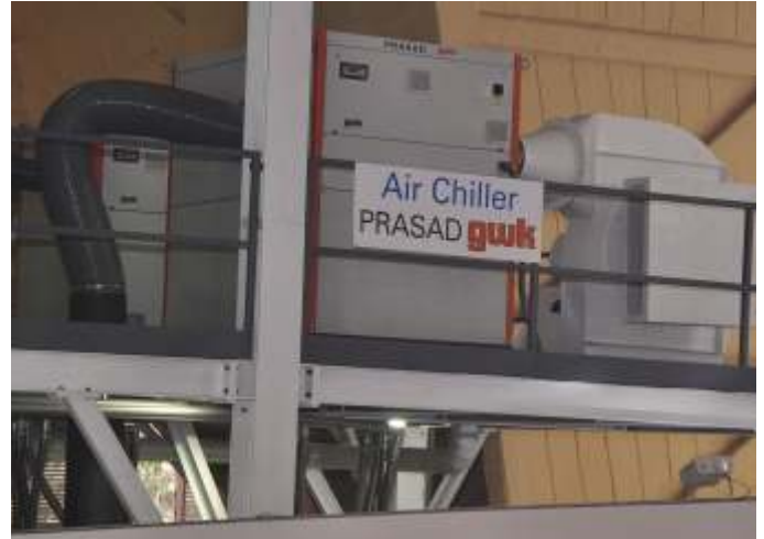
Air Chiller for OBC & IBC with Five Layer Blown Film Plant

The Group's success at the exhibition is a true testimony to its commitment of offering innovative, cost-effective and user friendly products.