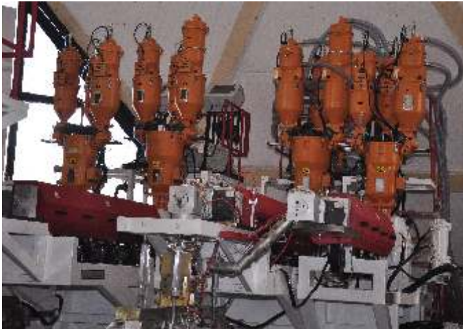
Multi Component Gravimetric Dosing Mixing System on Multi Layer Lamination Plant