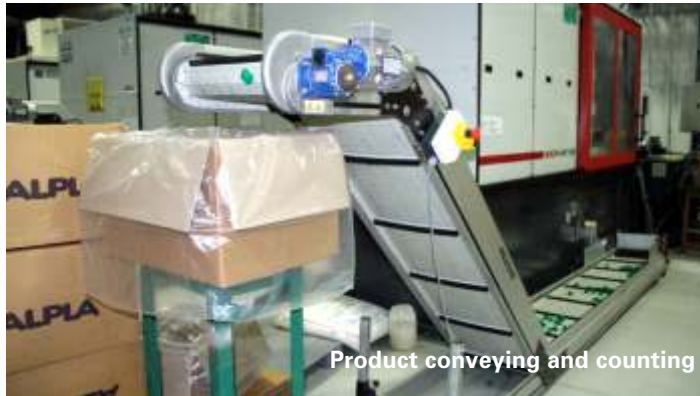
Product conveying and counting