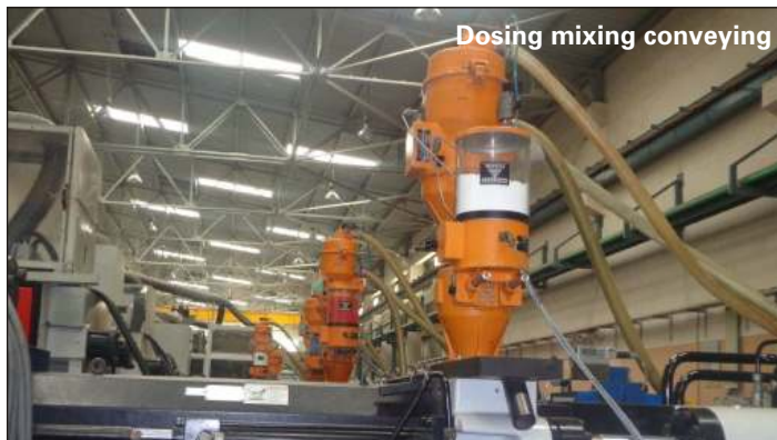
Dosing mixing conveying