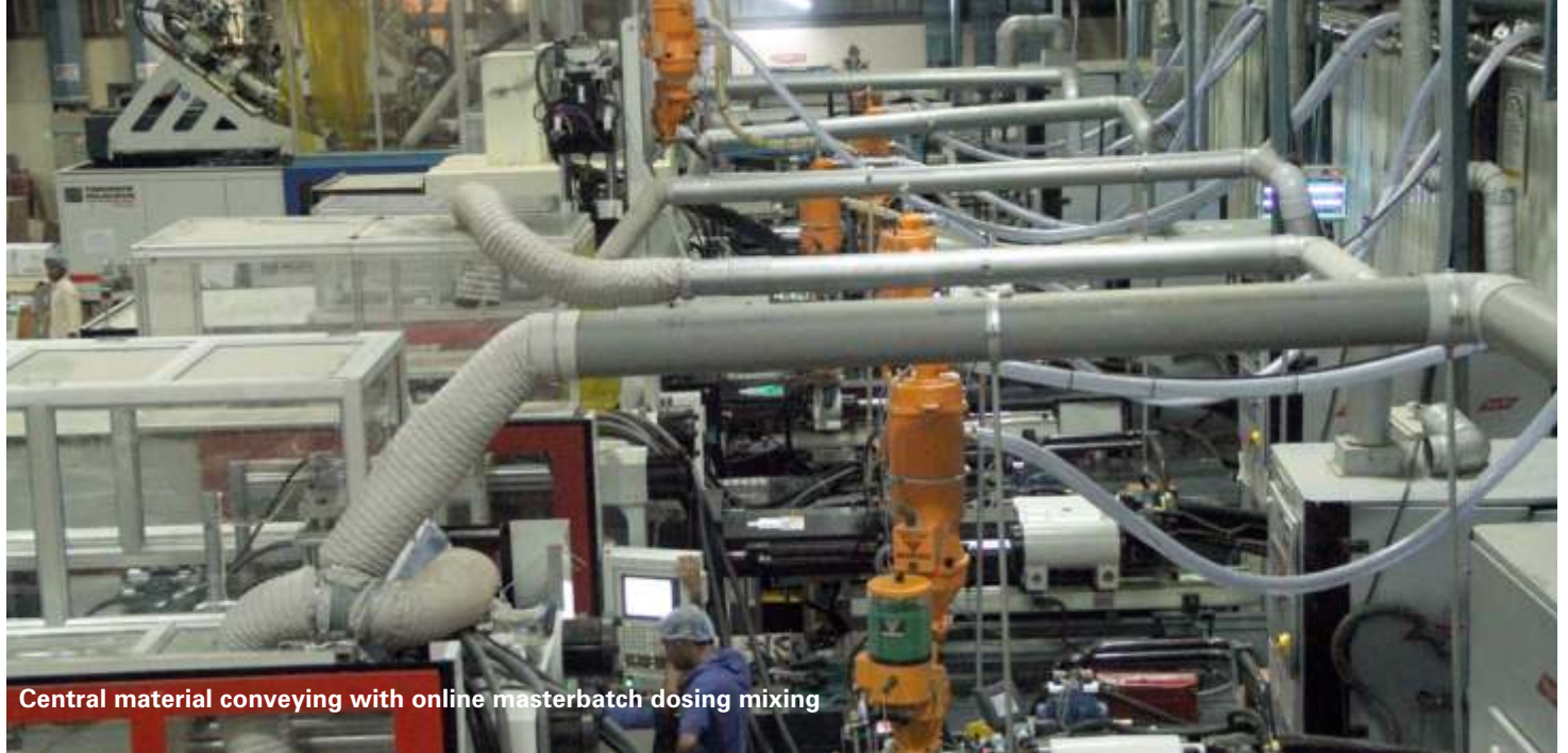
Central material conveying with online masterbatch dosing mixing

With its head plant in Austria, the company is a pioneering packaging company that uses the latest production technologies to provide the highest quality packaging to their consumers. The company works around the clock in the form of providing variety packaging for the most diverse contents from shower gels to engine oils, detergent to lemonade etc. Technical creativity and intelligence are the core values that have led to the ALPLA success story.