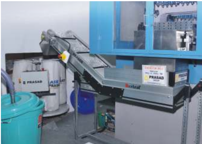
Conveyor Belt and Online Counting System for PET Preform